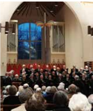
Dofasco Male Choir at St. Augustine Catholic Church