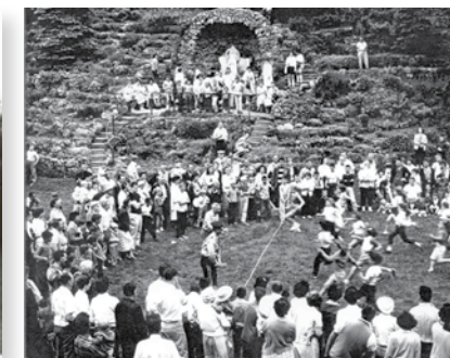
House of Providence Picnics 1879-1971