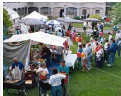
House of Providence Picnic Reunion 1992-2002