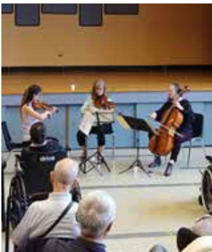
Hamilton Philharmonic Orchestra