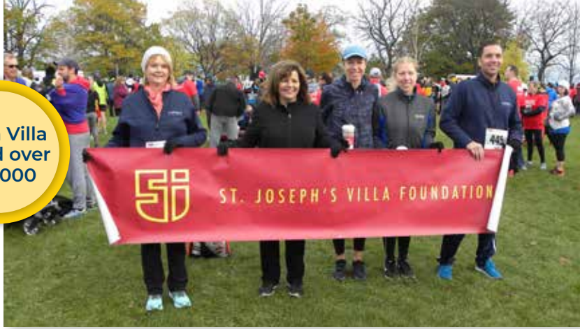
"Blue Wave – FirstOntario Credit Union"