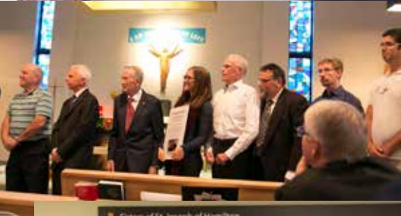
The Villa Men's Group