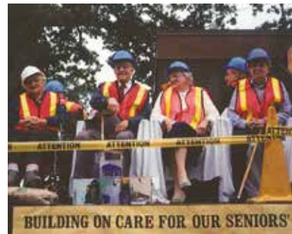
Building on Care for Seniors

December 2016 Capital Campaign for hospice at St. Joseph's Villa.