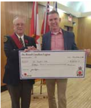
Royal Canadian Legion cheque presentation