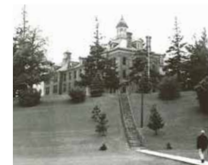
House of Providence 1879

City of Hamilton Future Fund grants $400,000.