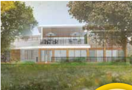
Overlooking the Ravine.