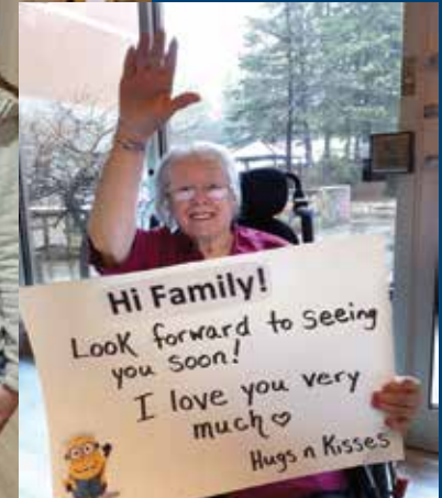
~ Messages of love from residents to families during the pandemic.