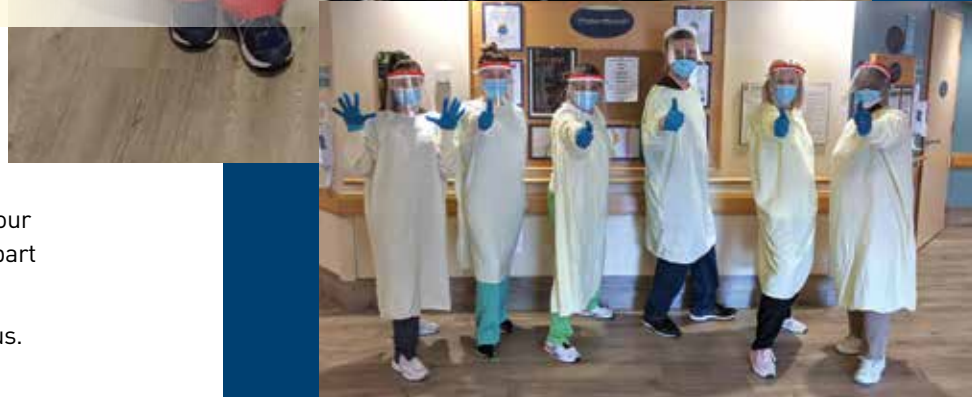
~ Geared up in PPE, serving on the front line of the health crisis to protect Villa residents.