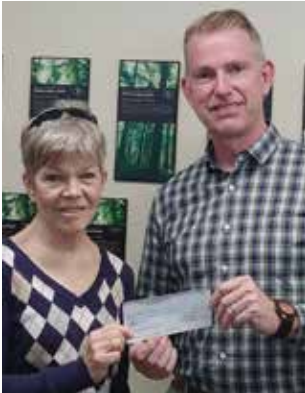
Dundas Association of Churches Cheque Presentation