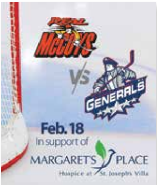
Real McCoy's Fundraiser