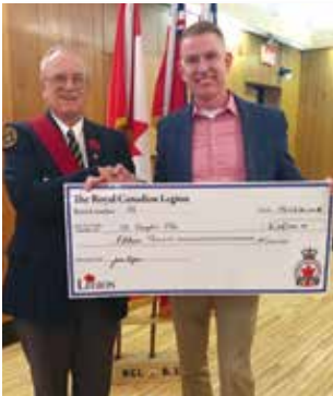
Royal Canadian Legion cheque presentation