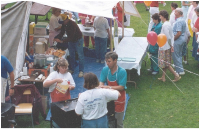
The Villa Picnic in the 1990's

Step back in time and join us at the “House of Providence Picnic” presented by the Congregation of the Sisters of St. Joseph Canada to celebrate the care and residents at St. Joseph’s Villa and Margaret’s Place Hospice.