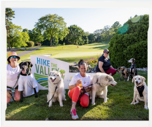
Furry friends at Hike the Valley 2022